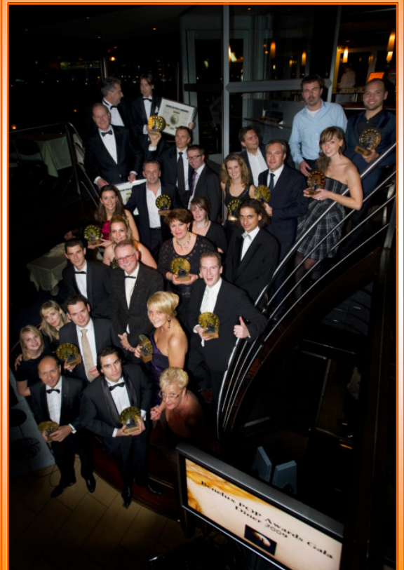
Award winners at the 2009 POP Award Gala

The KPN Mobile Phone Table is equipped with Duonell's Interactive Display Solution which is the ultimate method of product presentation. Security and live demonstration from the basis of an Interactive Display. Furthermore, interactivity provides customers with information on a product via a "simple" menu. This form of "guided self-service" enhances the shopping experience, reduces waiting times and greatly improves waiting-time perception. It also contributes to consistent sales information and eventually to increase sales. But there is more; Interactive Display provides store management with insight into important data such as consumer preference and store activities. The remote management functionality also enables retailers to supply displays with new content remotely, at the push of a button. This is how an Interactive Display can make a significant contribution to sustainable improvement of store performance.